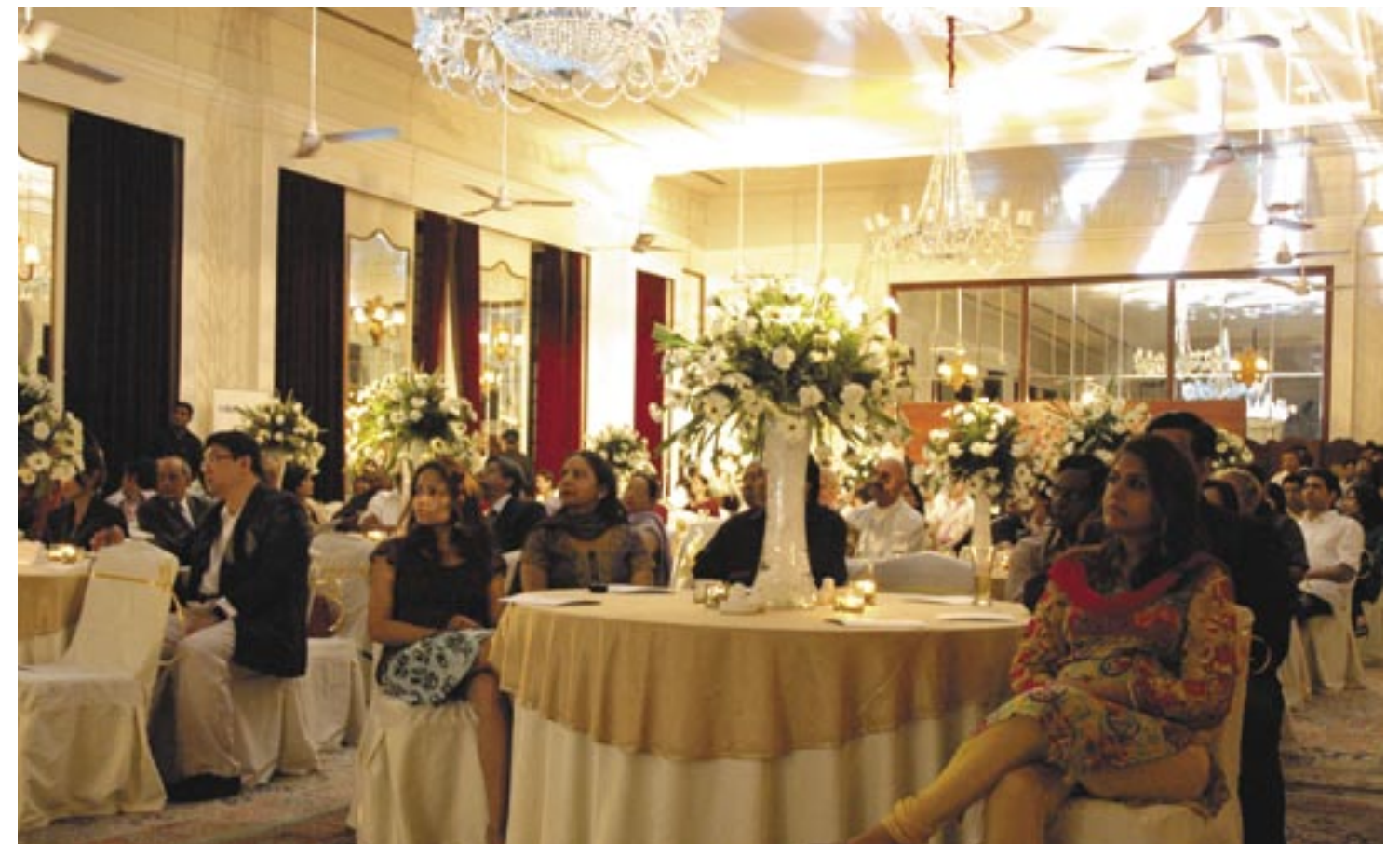
MILLIONAIREASIA'S INDIA LAUNCH WAS HELD IN AN ELEGANT SETTING AT NEW DELHI'S BEST HOTEL, THE IMPERIAL