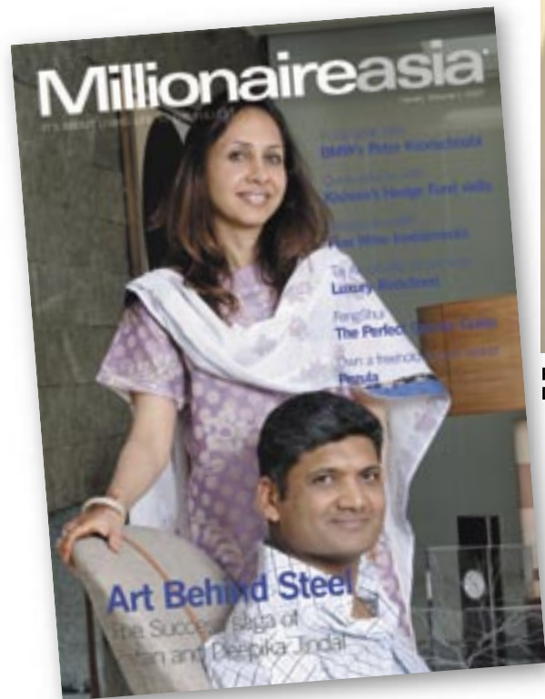
THE INAUGURAL ISSUE OF THE INDIA EDITION OF MILLIONAIREASIA